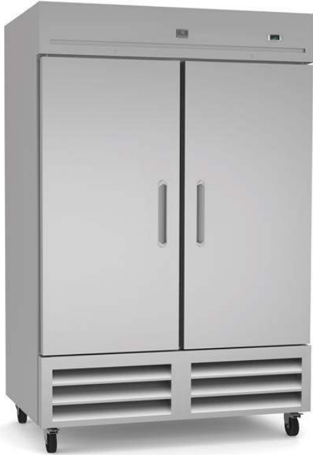
738242 (KCHRI54R2DRE) 2-Door Full Height Refrigerator 54" Long